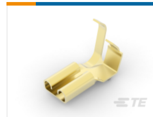
TE Part # 42618-1 187 FASTON FLAG REC 20-16 AWG BR