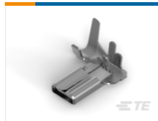
TE Part # 2238172-3 187 FASTON, FLAG, REC., 24-14 AWG, TPBR