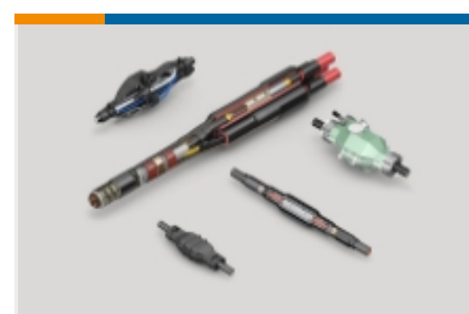
Joints & Splices(1)