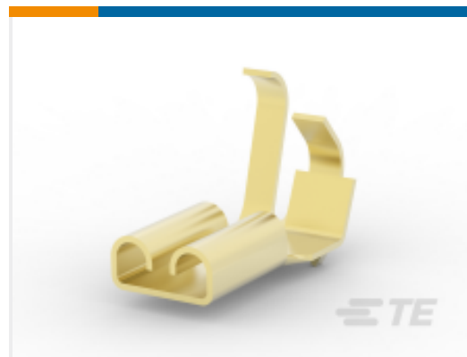
TE Part # 42486-1 187 FASTON FLAG REC 20-16 AWG BR