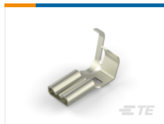
TE Part # 2238200-3 187 FASTON, FLAG, REC., 20-16 AWG, PTBR