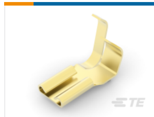
TE Part # 42800-1 187 FASTON REC 20-16 AWG BR